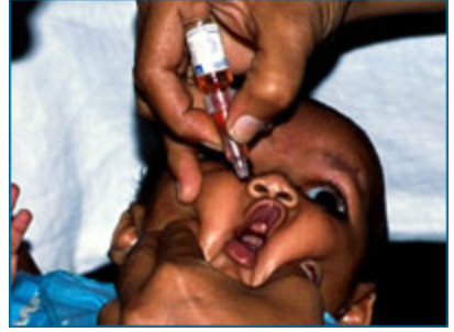
A child in India is given an oral polio vaccine.

• Want to get rid of polio? In the 1940s and 50s, American society got behind efforts to prevent and treat polio by donating to the organization called the March of Dimes. Through the March of Dimes, that societal concern financed research on polio vaccines. Science provided us with the vaccine that made prevention possible, and it also gave us an understanding of polio transmission that shaped our approach to administering the vaccine. If we wanted to truly eradicate the disease, only a massive vaccination effort would do the trick. Today, a polio vaccination is a routine